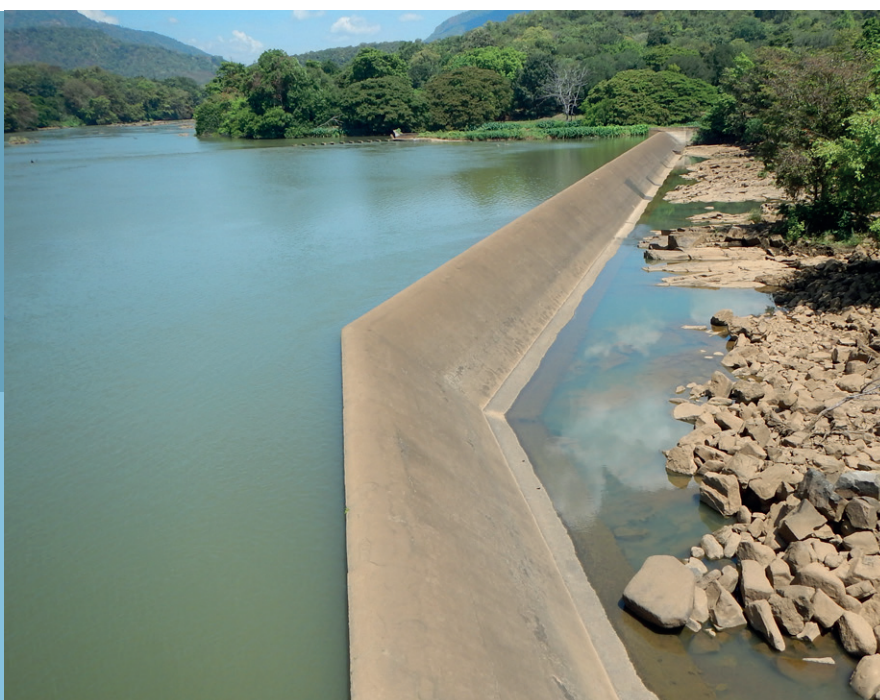
Minipe Anicut on Mahaweli River, Sri Lanka

Tractebel's modern approach to irrigation design and engineering integrates concepts and knowledge from advanced hydraulic engineering, water resources engineering, agronomy, and institutional reform, to implement successful multi-disciplinary projects.