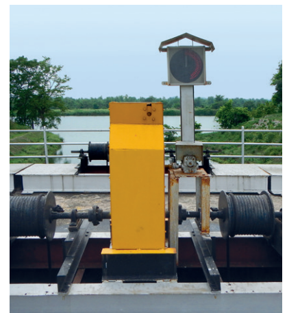
Automated monitoring of canal gates, India