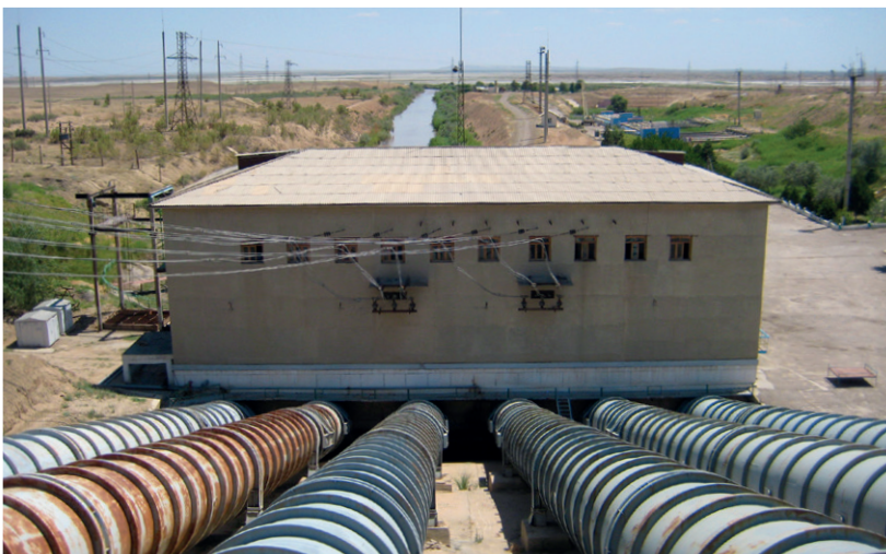
Kuyu Mazar Pump Station, Uzbekistan