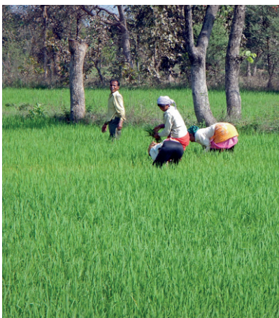
Paddy farmers, India

Water resources planning and engineering for an effectively implemented modernisation project relies on a broad, system-wide understanding: how water is presently being used, how re-allocations would impact established water use patterns, and how specific cost-effective changes can be achieved.