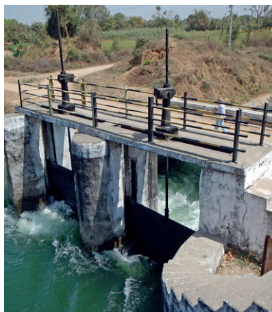
Branch Canal headworks, Dharoi Irrigation Project, Gujarat